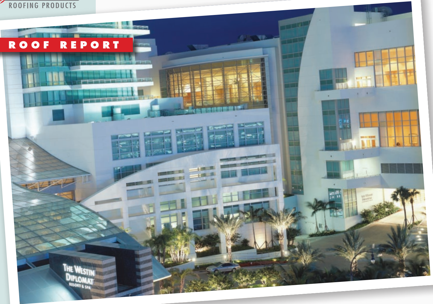
The Westin Diplomat Resort & Spa, Hollywood, Florida.