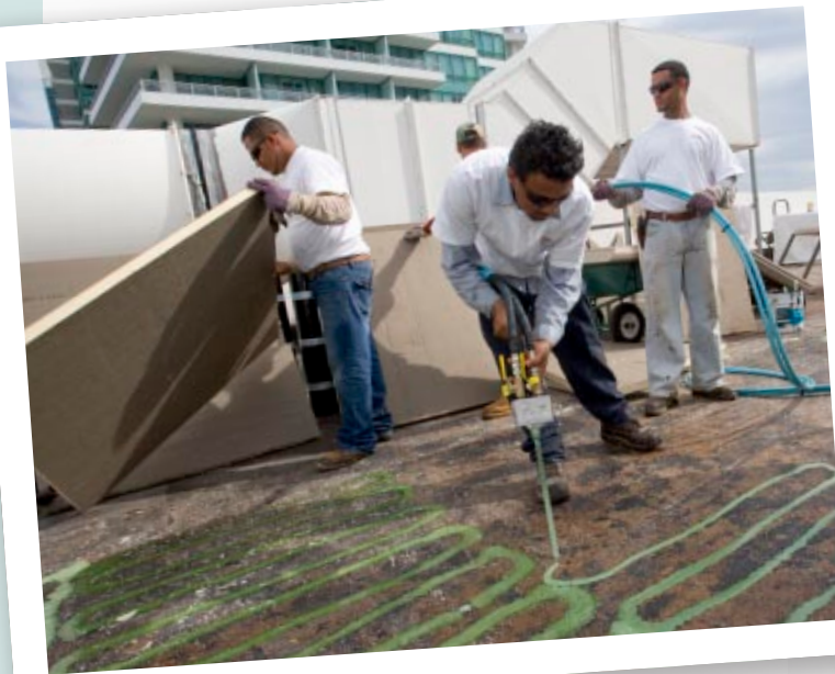
OlyBond500 Green was used to adhere the insulation directly to the concrete deck (left), as well as between multiple layers of insulation and cover board (below).

“We were able to enhance wind-uplift resistance, and eliminate the noise associated with mechanical fastening.”